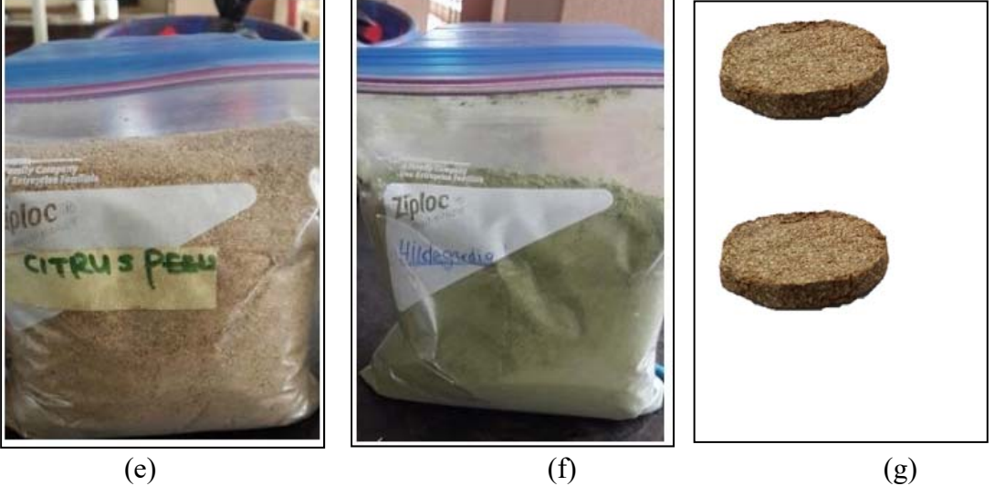
Plate 1: Pulverised tinder samples used for the lighter production: (a) Monodora myristica seeds, (b) Khaya grandifoliola sawdust, (c) Pinus caribaea needles, (d) Thaumatococcus daniellii leaves, (e) Citrus sinensis peels, (f) Hildegardia barteri leaves, (g) solid charcoal lighter produced